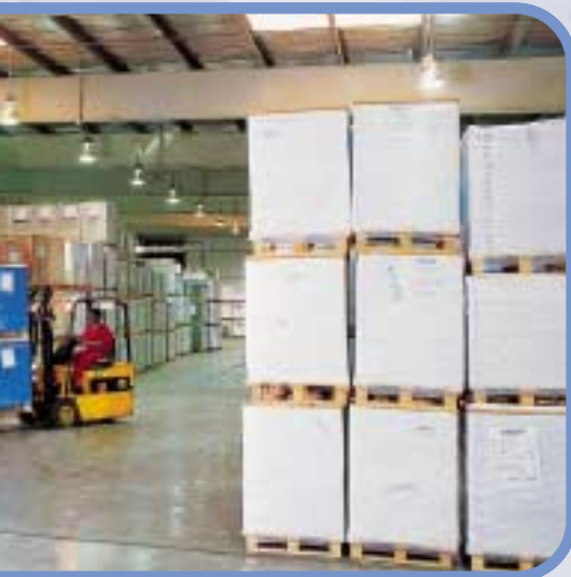
The Paper Store - printing needs met at a moment's notice

Complete with adjoining administrative offices, the new structure houses our entire staff so that everyone from senior executives to delivery crews works alongside one another in the spirit of teamwork that is key to our success.