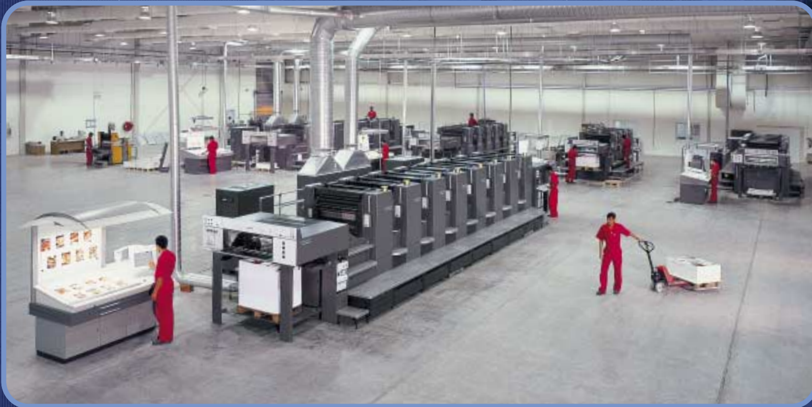
A view of the spacious Press facility