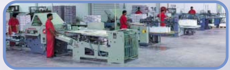
Folding Units - meeting every post-press deadline