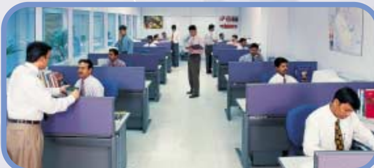
Marketing Division - consistently surpassing customer expectations of service

When it comes to global deliveries, in conjunction with the dedicated freight arm of our business, we have a wealth of experience in cartoning, shipping and air-freighting.