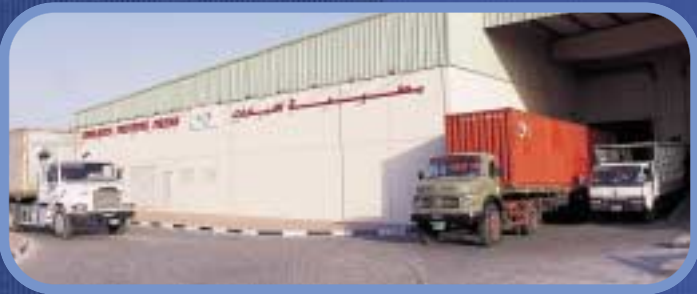
Dedicated Delivery Fleet – focusing on speed and reliability