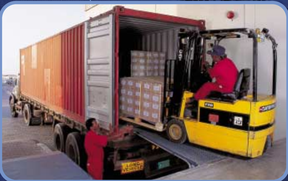
The Loading Bay ensures swift and secure despatch

Since mid-1999, EPP has operated from a specially designed facility in the Al Quoz Industrial Area of Dubai that boasts an area of over 170,000 square feet. With all departments – including our sizeable paper store – under one continuous roof and ergonomically laid out, the flow of production from pre-press through press to finishing and binding is smooth and seamless.