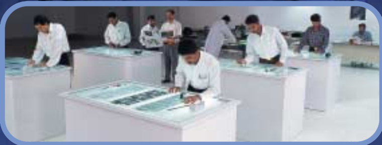
The Assembly Team – the best in skills and specialisation

Our marketing and administration staff, carefully selected from print-related disciplines, are groomed intensively in the skills of their job function. A team of highly-professional, English-speaking customer co-ordinators provides the crucial interface between our clients' production staff and our technical specialists.