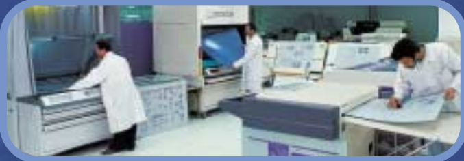
Seasoned hands take care of plate-making