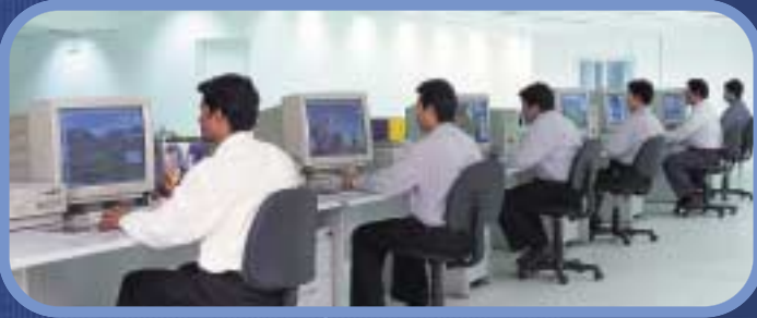
DTP Section – blending creativity and technology to perfection