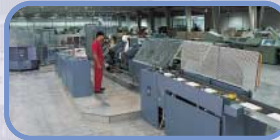
The fully-automated case binding unit

These – and many other – facilities provide fast, efficient and adaptable solutions to almost every binding requirement that our customers specify.