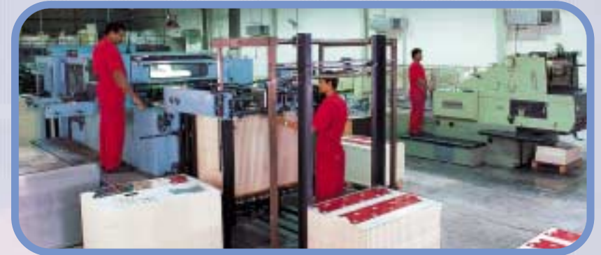
Die Cutting Unit and Foil Stamping Unit – applying cutting-edge technology