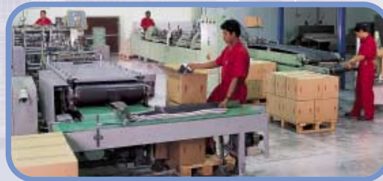
Folding & Glueing Unit - equipped for various specialised functions