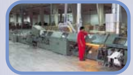
Collating & Binding - speedy and systemised

Stochastic screening is another advanced facility that we have introduced to the region.