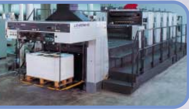
The Komori 5-Colour Press - harnessing technology in step with the 21st century

Our Sitma Cheshire polywrapping and mailing line makes light work of magazine mailing, while our fully automatic shrink wrapping and double-wall cartoning ensure that books are carefully protected for their lengthy journeys so as to arrive in pristine condition.