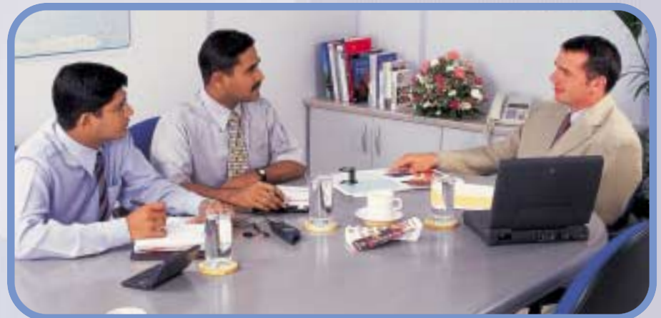
International Marketing Team – geared to meet overseas requirements

Our experienced team of senior managers has been responsible for the dynamic growth and internationalisation of EPP since the early days. Printers by training and possessing a wealth of experience, we continually update our skills and knowledge by reading up on latest developments, attending all major international print fairs and through regular visits to key suppliers.