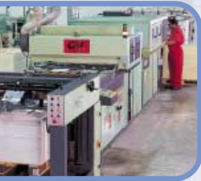
UV Varnishing Unit – adding a touch of finesse