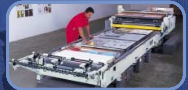
Our flatbed proofing is meticulously controlled